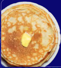
PIZZA SIZE LOADED PANCAKES