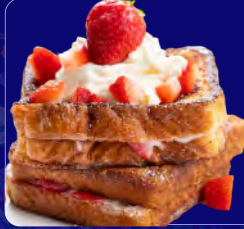
FILLED FRENCH TOAST